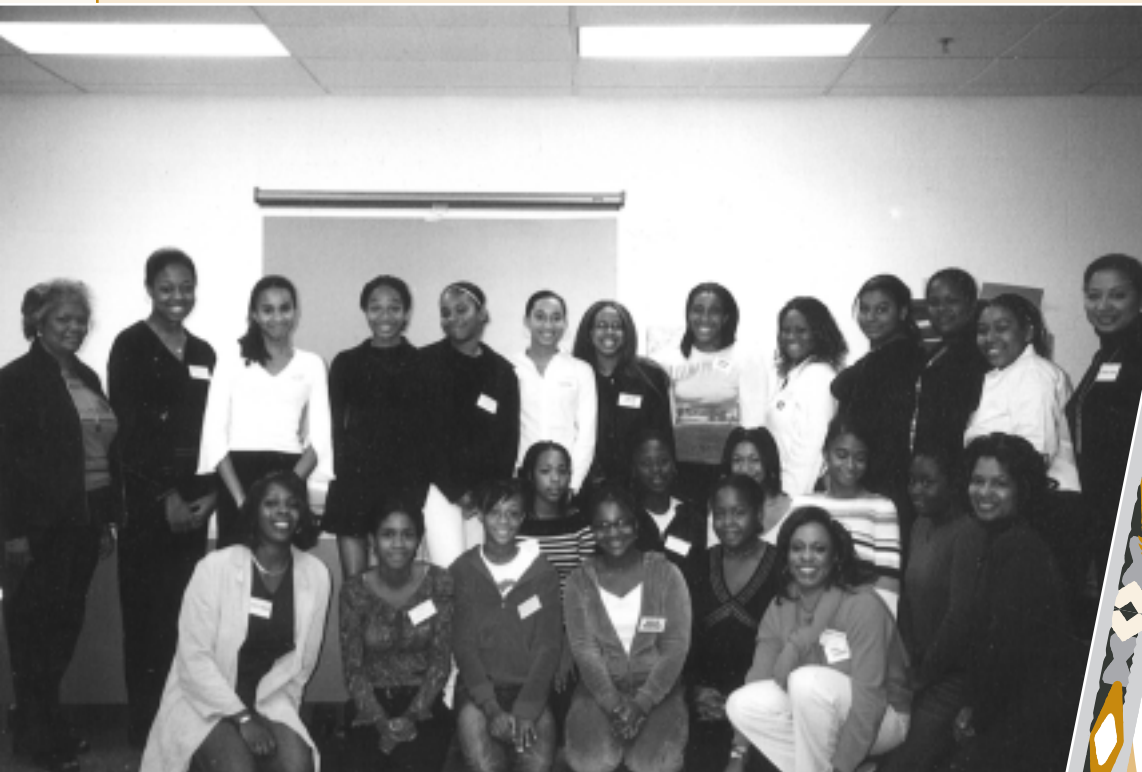
NCNW Rites of Passage Committee members photographed with 2004 program participants

President, NCNW Girl's Rites of Passage Program