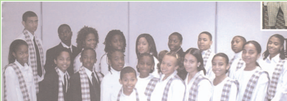
Youth Usher Board