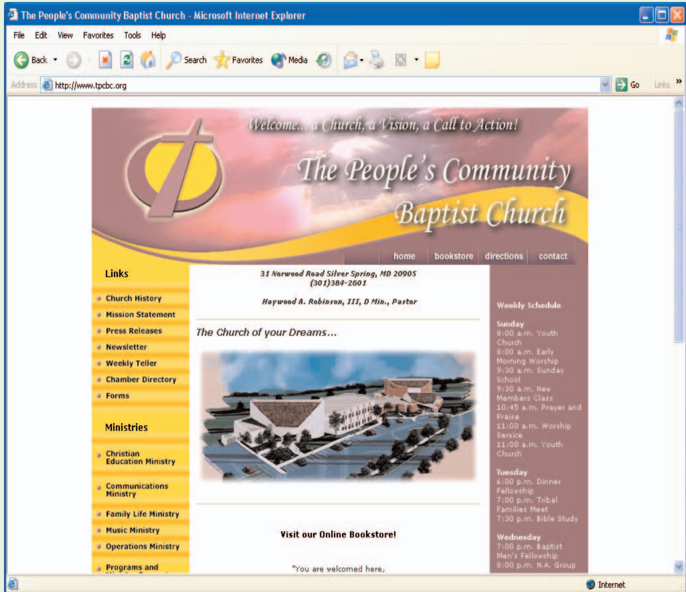
Pictured - The People's Community Baptist Church home page.

See our new look! Visit The People's Community Baptist Church website at www.tpcbc.org . You'll find easy to download forms, valuable links and updated information on what our ministries are doing. Click on the Bookstore's web page while you're there and check out the Book of the Month, or the featured gospel CD.