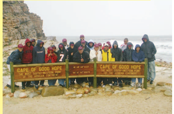
Baptist Men's Fellowship in Capetown, South Africa

Before departing Capetown, we toured the Parliament, visited the well-known Robben Island where Nelson Mandela and many other Republic of South Africa Freedom Fighters were imprisoned, and spent an unforgettable evening at the Drum Café where we all participated in drumming.